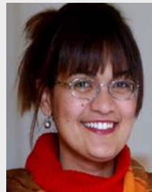
Judith February Institute for Security Studies