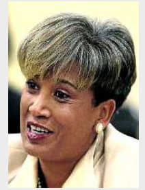
Judge Leona Theron Concord Judge

hard-nosed attitude to rape and gender-based violence in South Africa.